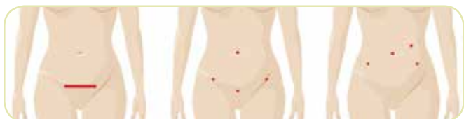
Open Surgery Incision

Your surgeon removes your uterus through a large open incision. The incision must be large enough for his or her hands to fit inside your body and touch your organs.